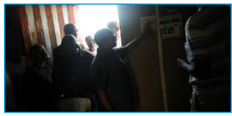
from darkness to light

The CRDP programme is intended to supply the Heuningvlei, Schmidsdrift and other rural communities throughout the province with solar panels.