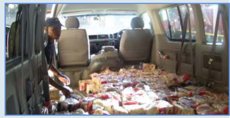
Loaves of bread handed over to families affected by the floods

The Department in conjunction with Sasko handed over loaves of bread and food parcels to the 23 households affected by the floods.