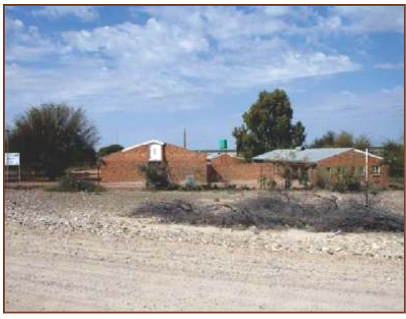
The clinic at Heuningvlei