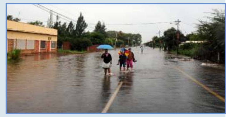
Water level at Griekwastad