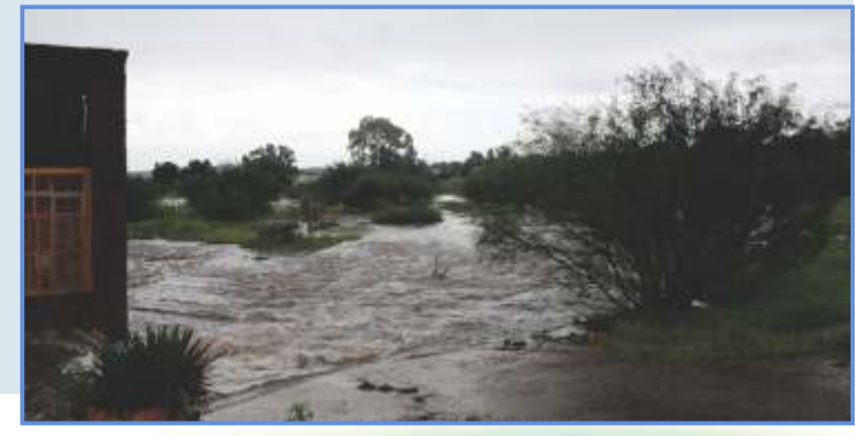
Water level rises in Griekwastad