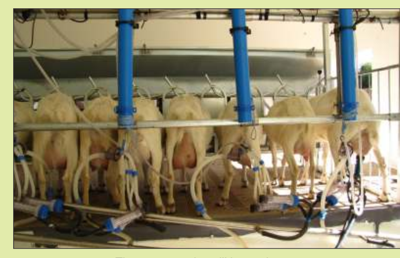
The new 12-point milking parlour