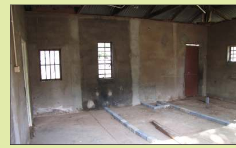
The facility before renovation

In 2010 two Saanen bucks and 24 saanen does were procured and 38 doe's will be in milk at the end of the kidding season. The fertility of the saanen goats is very high and the flock already boasts two sets of triplets and one set of quadruplets born during the 2011 Kidding season.