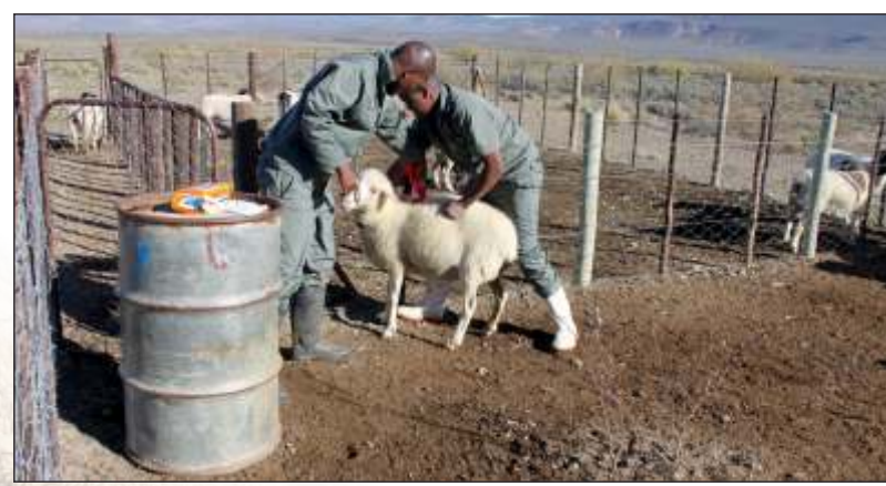
Officials treating animals against Sheep Scab