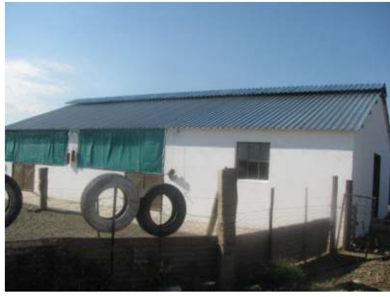
Proper housing structure for raising day old ostrich chicks constructed by the department

One of the project owners Mrs. Lean Botha highlighted how the cash injection from the department boosted their project. "Ostriches are very sensitive especially when they are young, it is our responsibility to make sure that good infrastructure, water and medications are in place to avoid the high mortality rate really we are thankful for what the department has done". She however admitted though that the are challenges that the project is experiencing.