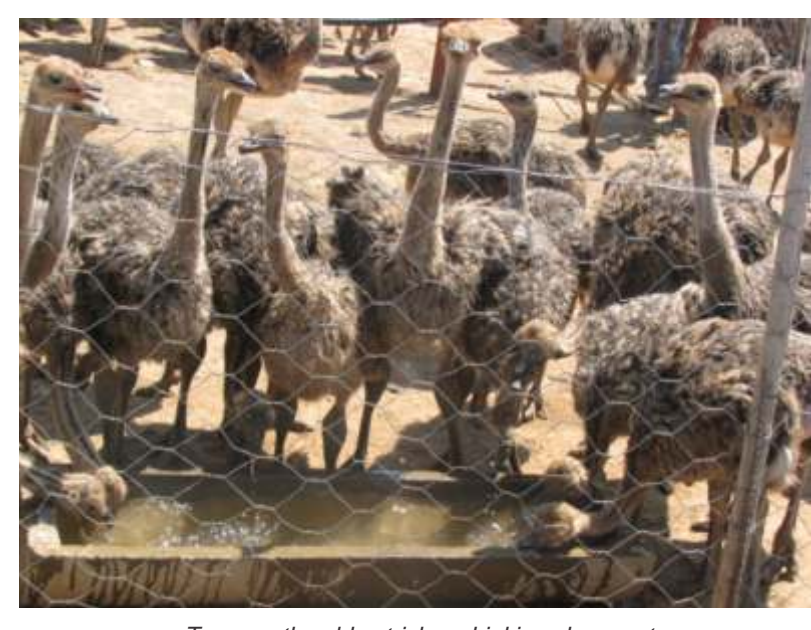
Two months old ostriches drinking clean water from the water trough