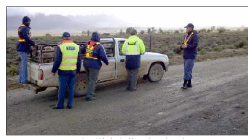
Road Blocks for Sheep Scab Control

The Springbok office also had to deal with sheep scab outbreaks, but the biggest problem in that area was the false accusations from the commercial farmers about Veterinary Services' inability to deal with it. One farmer complained that the department was not doing enough and this accusation almost led to a breakdown in the otherwise good relationship that Veterinary Services normally has with the organized agricultural sector.