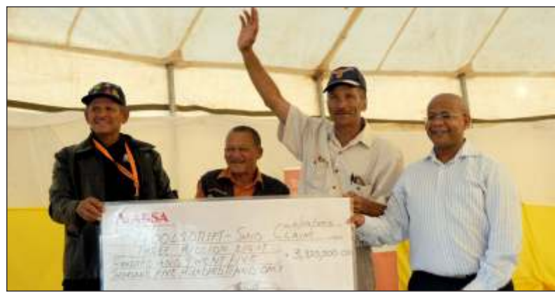
MEC Shushu and community leaders holding the cheque