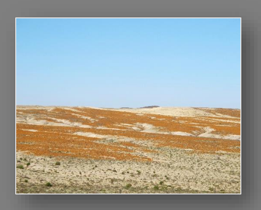
Namib lichen fields outside Alexander bay

Drivers of habitat loss: The advanced threats status of these ecosystems are due to their small sizes, the rate of habitat loss and limited intact habitat left. Habitat loss in the Bokkeveld region is primarily due to Rooibos tea cultivation and other agricultural lands and in the northern coastal region due to mining activity.