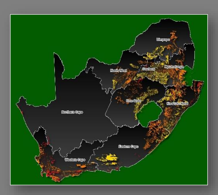
South Africa's Draft Red Listed Ecosystems (2021)

The Northern Cape Province has a number of land-based threatened ecosystems that are contained in the draft Red List of Ecosystems for South Africa (2021). This list was compiled to supplement the 2018 National Biodiversity Assessment and replace the previous 2011 Red List. The criteria used is that of the IUCN Red Listed Ecosystems Framework which is the current standard in global evaluations.