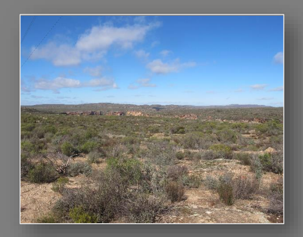
Renosterveld vegetation of the Bokkeveld

Implications for development: The National Environment: Biodiversity Act (No. 10 of 2004) makes provision for the listing of ecosystems that are threatened and in need of protection. The status of ecosystems are considered in environmental authorisation reviews to ensure that ecosystems and their functionality is maintained. Representative areas of Ecosystems must be protected and development must not push ecosystems into